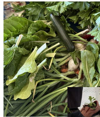
Some of the harvest from our vegie garden

Don't let ageing get you down; it's too hard to get back up again.