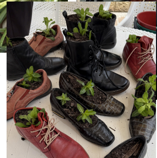
Fun activity - making shoe planters